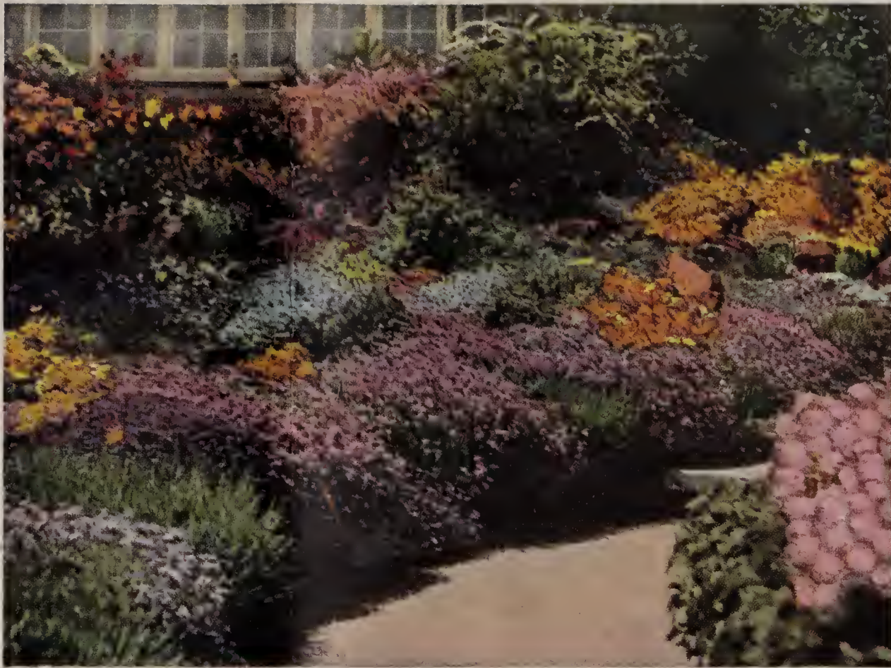
An effect easily acquired with rock plants offered in these pages.

● Too many rock gardens are built and planted and considered finished for all time. They are attractive for a year or two and then become straggly masses of unkempt plants.